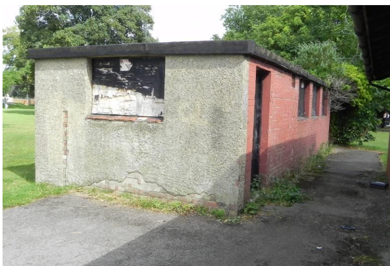
The one-time air-raid shelter

A new café was first proposed several years ago, and the latest design was approved at the end of June by West Berkshire Council's western area planning committee. It will replace the existing café in the park (a bland building), together with the nearby storage building, which was originally a surface air-raid shelter for the then-adjacent nursery school. This will be photographed and recorded before demolition.