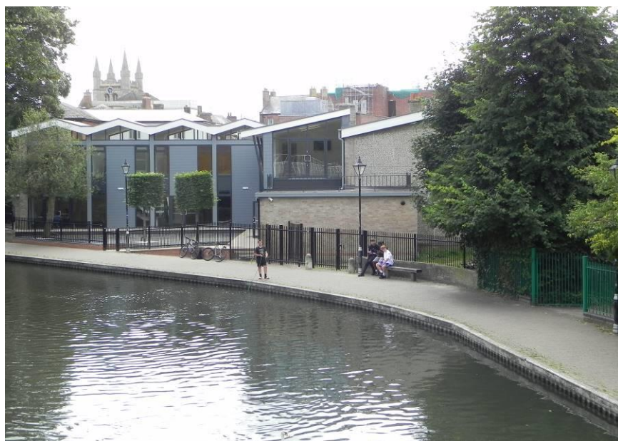
The Canal near the Waterside Centre – one area affected by Masterplan proposals

The full text of this draft is still available on the West Berkshire Council and Newbury Town Council websites. Proposals were put forward under ten headings, mostly area by area, including the Kennet & Avon Canal, and Newbury’s “Lanes and Yards.” Each section included a combination of proposals, with respondents asked to comment on the proposals as a whole. This posed difficulties in sections where both good and bad proposals were put forward, and where proposals were so vague that without further details it was difficult to decide whether they were good.