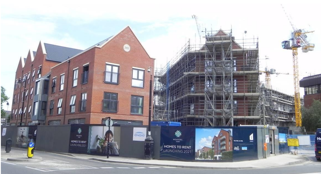
The Market Street 'urban village'