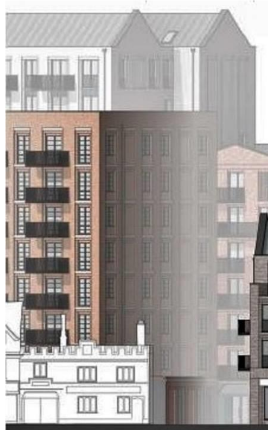
The Catherine Wheel with part of Block A behind

The listed buildings affected include the Catherine Wheel and Save the Children in Cheap Street, which would have an eight-storey block of flats immediately behind, and a new five-storey block between them and the cinema.