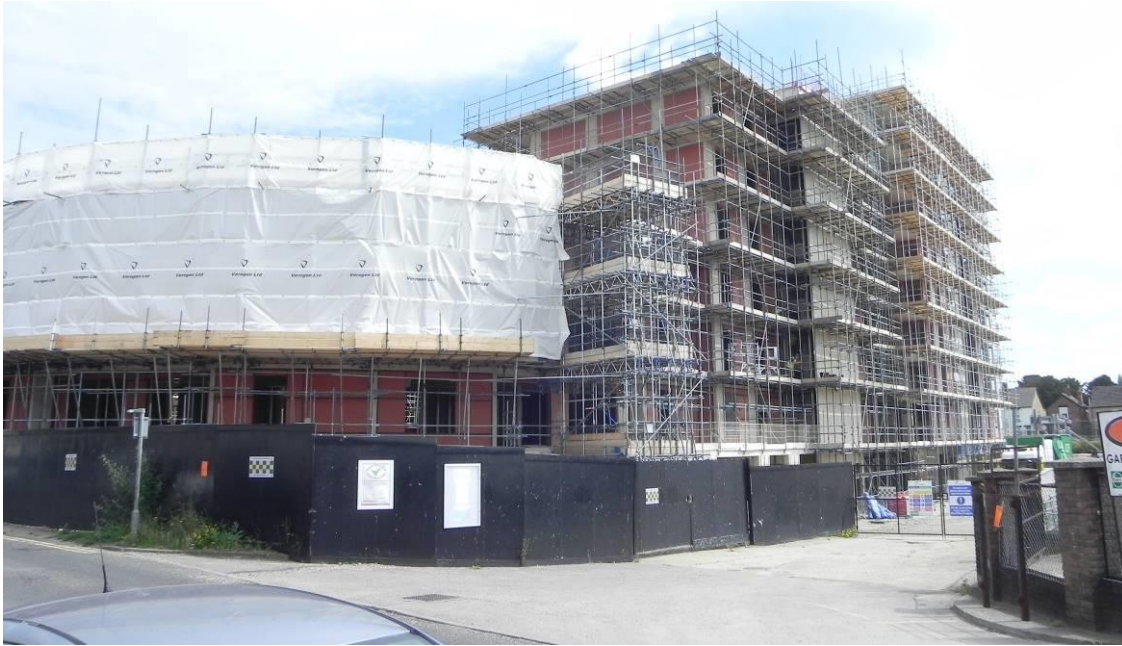
The Sterling site flats