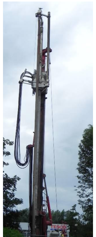
The top of some plant at the former Narrowboat site (new London Road Lidl) offers good views!