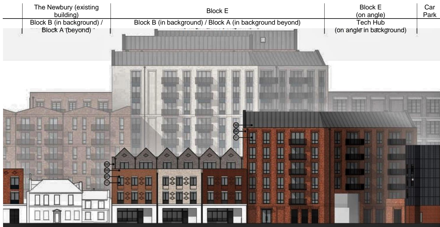
Bartholomew Street, showing The Newbury , Block E, and the development behind

The Newbury Society is in favour of redeveloping the Kennet Centre; however, redevelopment could take many forms. We accept that it is likely to include flats. But any redevelopment should be appropriate for Newbury, and should protect and enhance the unique qualities and attractions which Newbury possesses. These Lochailort plans, with 8-, 10- and 11-storey blocks of flats, will inflict long-term damage on the town's character, making it less attractive both for visitors and for existing residents.